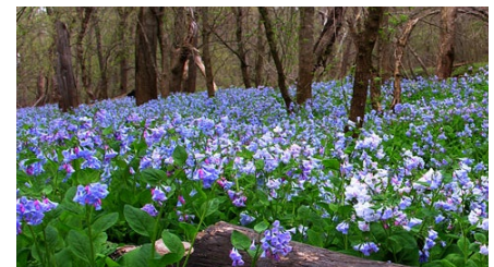
A squad of officer candidates charge forward into the Quigley water obstacle (top). Merrimac Farm, protected with REPI and partner funds, has one of the largest patches of Virginia bluebell flowers (bottom,).