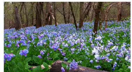
A squad of officer candidates charge forward into the Quigley water obstacle (top). Merrimac Farm, protected with REPI and partner funds, has one of the largest patches of Virginia bluebell flowers (bottom,).